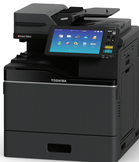
The e-STUDIO330AC/400AC Series is small enough for the desktop but big enough for the most demanding jobs with impressive features you'd expect to find on Toshiba's larger departmental MFPs.

This series not only has a compact footprint, but a compact carbon footprint. They are RoHS compliant, use recycled plastics, and have a Super Sleep (1W) Mode. They also reduce the environmental impact by being EPEAT Gold and Energy Star V 3.0 certified.