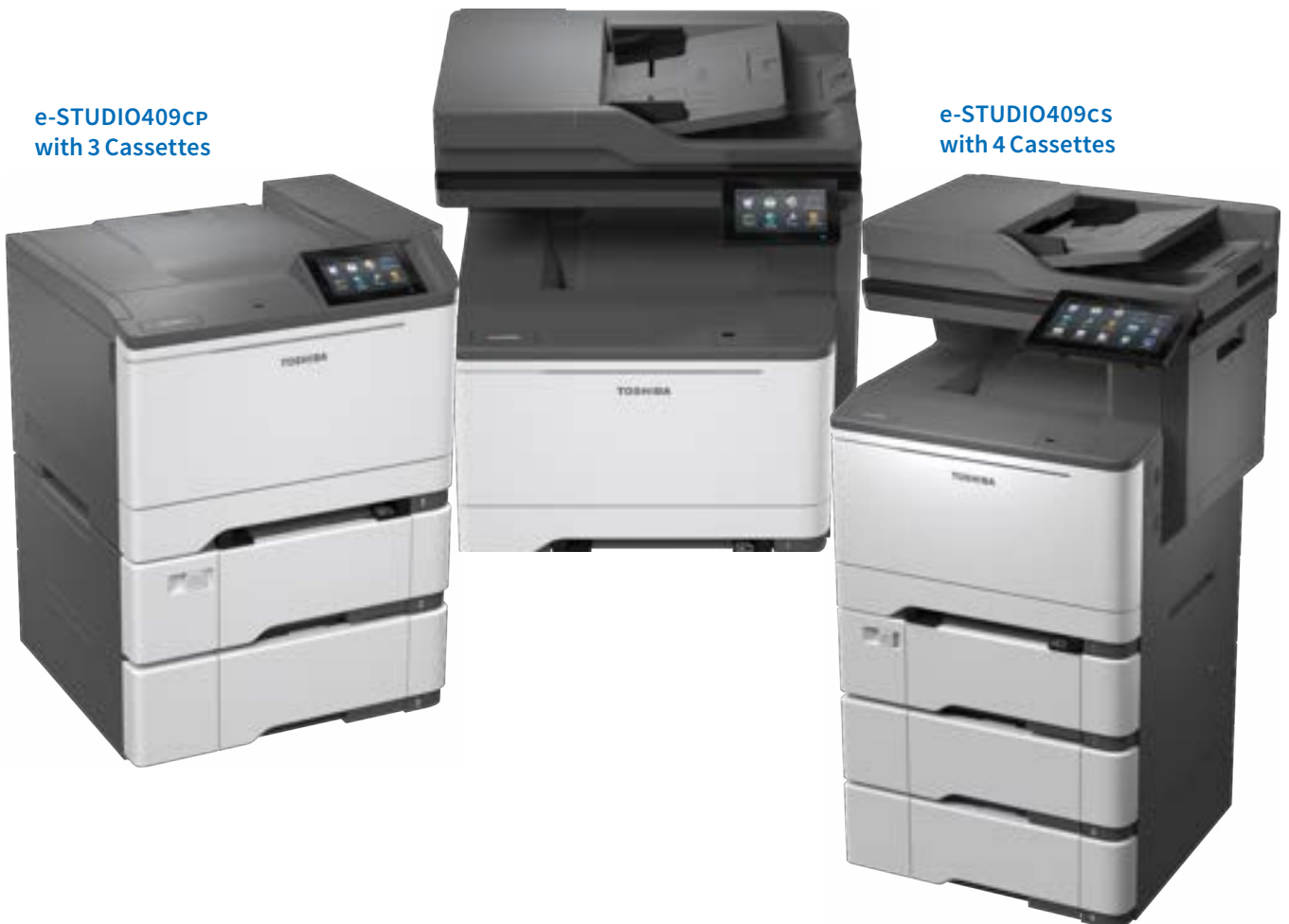
e-STUDIO409cs with 4 Cassettes