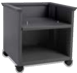
Adjustable Printer Stand