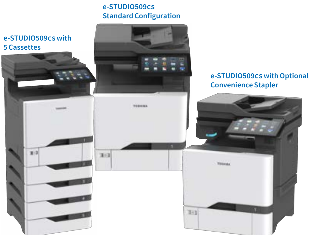
e-STUDIO509cs with 5 Cassettes